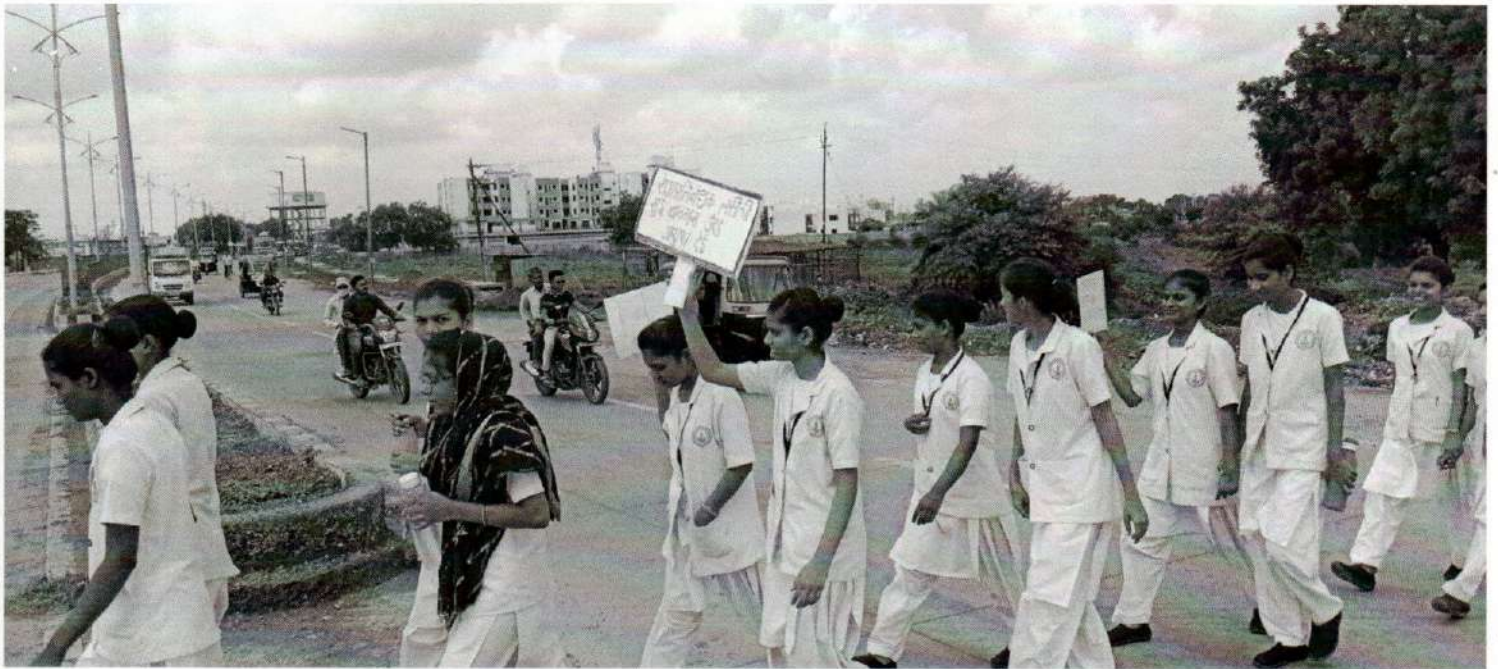
ACTIVITIES:- CELEBRATED HIV/AIDS AWARENESS DAY AT MODI HOSPITAL ON 01/12/2023.