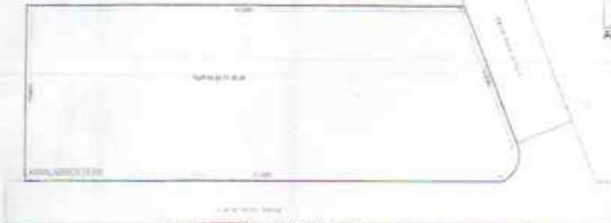
PLOT AFTER AMALGAMATION (Scale - 1:200)