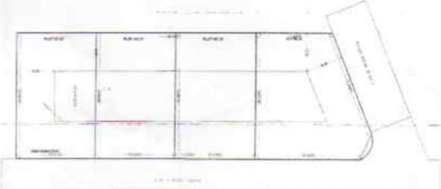
PLOT BEFORE AMALGAMATION (Scale - 1:200)