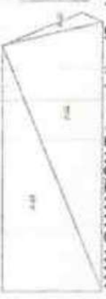
AMALGAMATION Triangulation (Scale - 1:500)